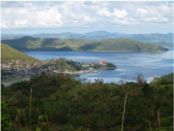
Possible relocation site with view of Culion

For the community of Osmeña Fr. Jody and the LGU have already one concrete place in mind as a relocation site. But it is a long drive on a gravel road far away from the centre of the main island. It is on top of a hill with a spectacular view over the whole bay. Fr. Jody is telling us that they had already plans to use it to develop the tourism in Culion further by building there a wedding chapel and a reception hall with catering. The idea would be to settle the community in small pouches along the hill with direct access to the sea and a docking station for the boats. Not only fishing would then provide an income for