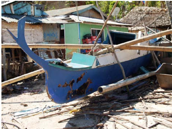
Many boats in Galoc were damaged

centre.” In Galoc 314 houses are destroyed, 110 partially damaged and 78 boats are gone. In Galoc people are unwilling to consider relocation even though they experienced a huge loss of houses. The school is still damaged so that all grades are being taught in the same classroom. As on the islands with the indigenous communities SLB is considering to build in Galoc a very strong housing or evacuation centre that can also serve as chapel, school or multi-purpose hall. The capacity building and community development would also be very important in Galoc.