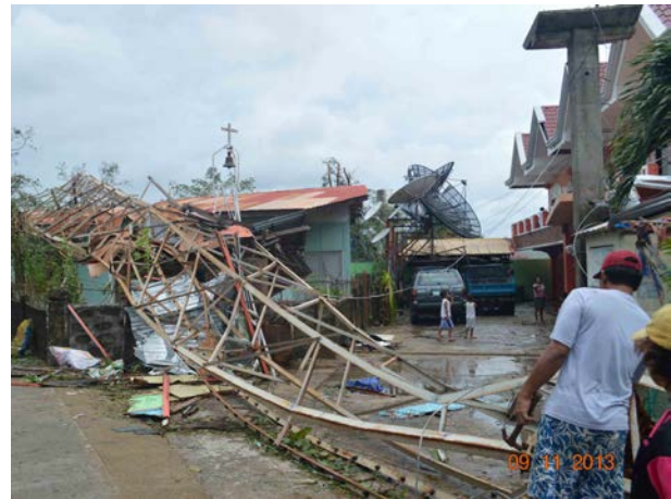
The old telegraph pole didn't survive the typhoon

Culion is subdivided in 14 barangay (villages) and according to the official numbers provided by the LGU 5,692 families or 22,280 individuals were affected by the typhoon. 117 people suffered from injuries and 5 died. 4,812 houses were partially or totally damaged and 485 boats were destroyed. There is a need for SLB to verify some of the data on the ground because of some doubts of its trustworthiness. For example the Loyola College was listed as totally damaged and in Binudac we were told that the captain (village headman) had registered his three intact boats as damaged. There is also some confusion about the total number of affected people because the 2010 census counted a total population of 19,543 people in Culion. It may be possible that the indigenous population (IP) who is living on some of the islands quite isolated and according their traditional way of live with their own languages and customs had not been included in the census but in the list of the LGU.