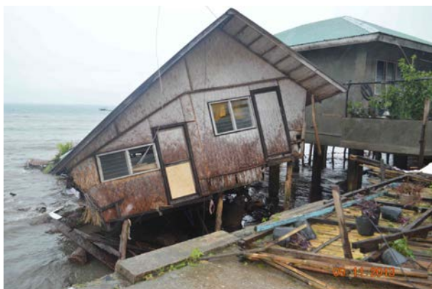
Culion one day after the typhoon had hit

After an almost two hour boat trip we arrived at the main island of Culion. The first thing people told us was: "You are lucky! Tonight is the first time after the typhoon that the electricity came back!" Usually on the main island of Culion electricity is provided 12 hours per day as the power plant is operating from 12:00 noon to 12:00 midnight. It is owned by a private company and according to local opinion its erratic or non-existing operating hours after the typhoon are more due to the moods of the owners than to any other real reason. The next morning it becomes clear why the electricity came back. At 6:30 a.m. the sound of a helicopter is alerting everybody and small fishing boats with people from the nearby islands are coming. The governor of Palawan has arrived for a political rally combined with music and the distribution of relief goods to the fishermen from the small islands around. Everything seems to serve the objective of publicity and when the governor leaves Culion with him goes the electricity again. Later a group of women from Binudac would tell us that they had to wait the whole day in the line up for the relief goods and had to spend the night in Culion because it had become too late to be able to find transportation to Binudac which is a small village on the other side of the main island.