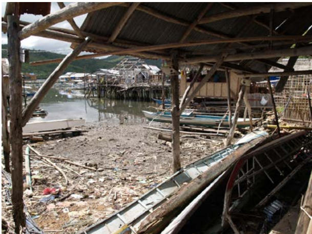
Damages in Osmeña

started to rebuild their houses. One family told us that it took them only one day to reconstruct their home. In Osmeña 338 houses have been totally destroyed, 799 houses are partially damaged and 66 boats are gone. The main challenge in Osmeña is to convince the people that it would be safer to relocate to another site. The place is not safe and any next disaster will probably again cause damages. On average there are 20 typhoons every year in the Philippines. The issue of relocation will be an important and complex consideration in the rehabilitation program. In this aspect SLB will rely on the expertise in geohazard maps and site assessments of Fr. Pedro Walpole SJ and his institute ESSC (Institute of Environmental Science for Social Change) which is also part of Ateneo de Manila.