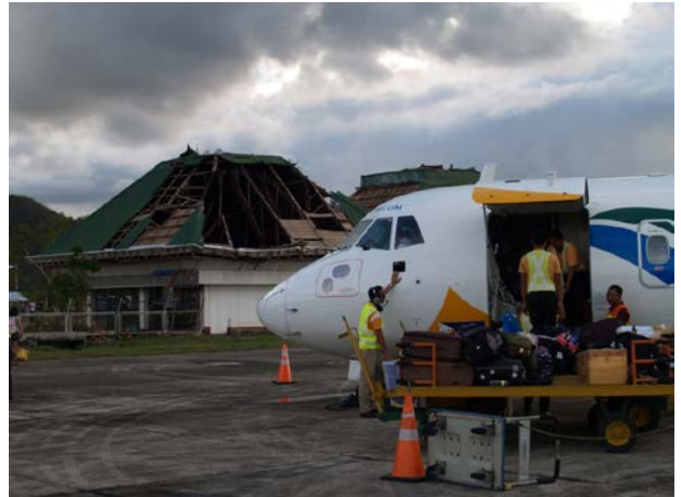
Arrival at the airport of Coron