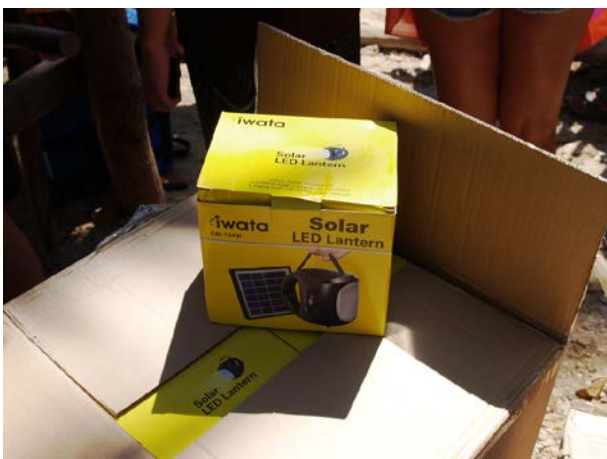
SLB distributed 250 solar lamps in Galoc

because we never had a boat. My husband is working as a fisherman but we don't have our own boat. We are lending the boat from our neighbours. We want to stay here and not move to another site."