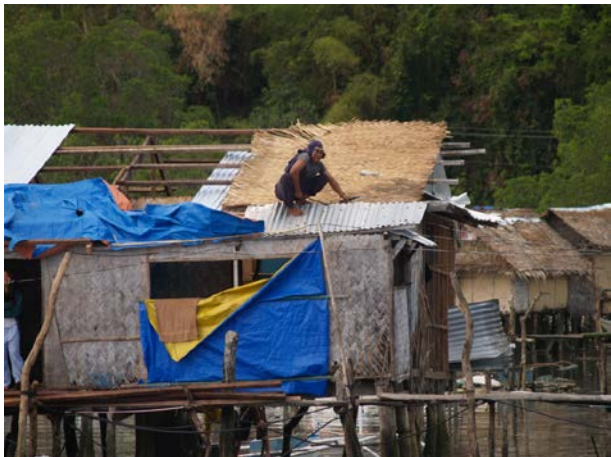
A man in Osmeña is repairing his house

For the community of Osmeña Fr. Jody and the LGU have already one concrete place in mind as a relocation site. But it is a long drive on a gravel road far away from the centre of the main island. It is on top of a hill with a spectacular view over the whole bay. Fr. Jody is telling us that they had already plans to use it to develop the tourism in Culion further by building there a wedding chapel and a reception hall with catering. The idea would be to settle the community in small pouches along the hill with direct access to the sea and a docking station for the boats. Not only fishing would then provide an income for