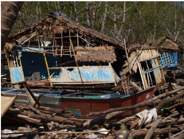
Galoc suffered severe destruction

The next day we went by boat to the island of Galoc. On the way we passed a big resort owned by a Chinese company and several pearl farms which are offering an additional income besides fishing. We also could see the mangroves that had protected the impact of the typhoon on the shorelines. When we reached Galoc Fr. Javy was visibly shocked: "There used to be three rows of houses on the waterside and wooden landing stages for the fishing boats. And now all of it is gone!"